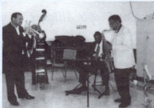
Grace Notes perform for Tasker Homes Older Adult Center members.

Tasker Homes Older Adult Center, 3101 Morris Street, 215-684-4895.